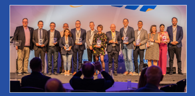
Awards Ceremony 2023

20.00 – 22.30 Welcome dinner in the restaurant of the Divani Caravel Hotel (Dress code: Business)