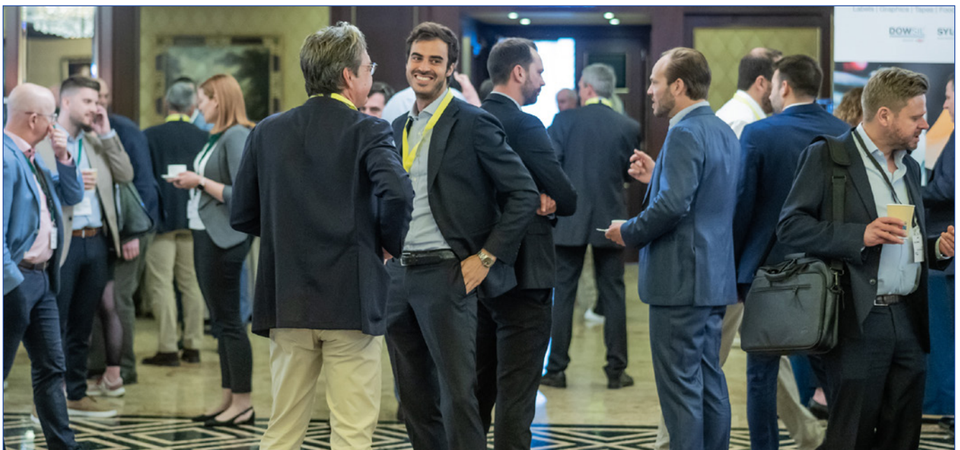
FINAT ELF 2022: B2B networking break

Opportunity to refresh, (re-)connect with industry peers and visit premium suppliers represented in the lobby expo area.