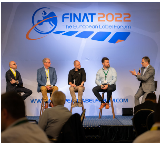
Panel discussion ELF2022