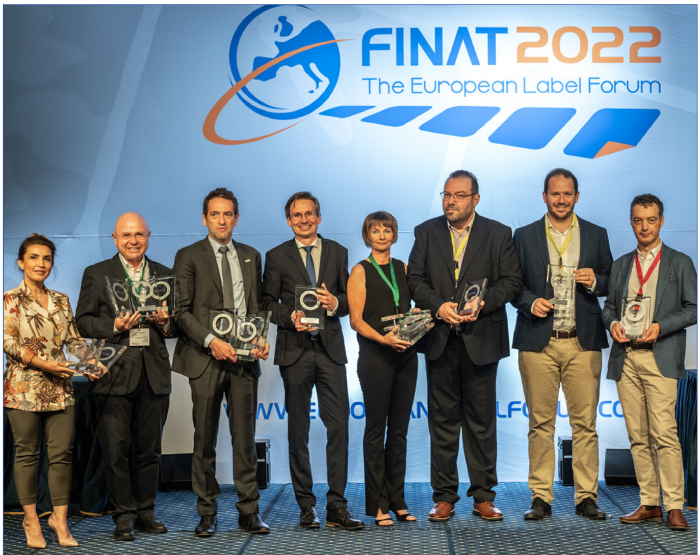
Awards Ceremony 2022